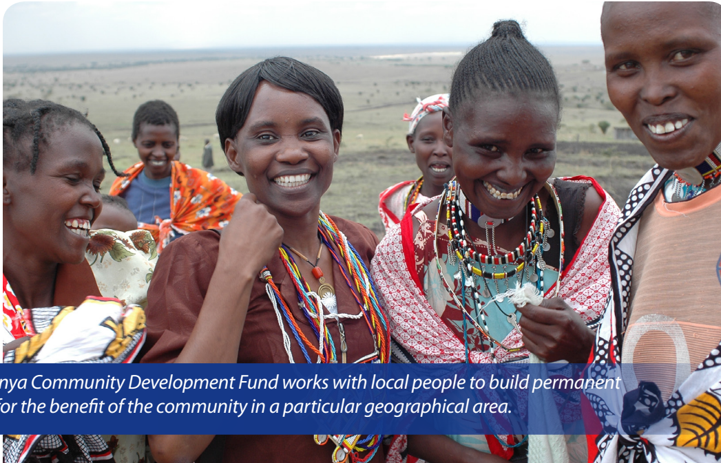
The Kenya Community Development Fund works with local people to build permanent funds for the benefit of the community in a particular geographical area.

A particularly important task is to build on various indicator sets developed by the Knight Foundation 10 and the Global Fund for Community Foundations. 11 Once this is done, it would be useful to publish studies that demonstrate the added value of community philanthropy to the field. These should focus on what is different about outcomes when community philanthropy is present compared with when it is not. As we saw with the Tewa example earlier on, it is empirical evidence that provides proof of concept.