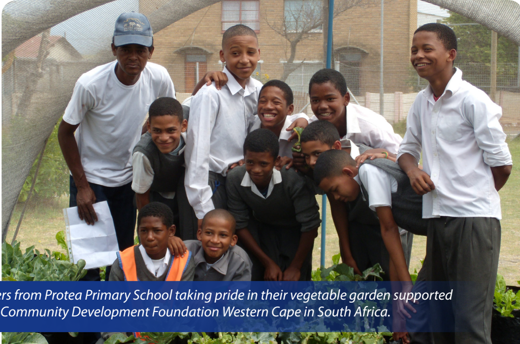
Learners from Protea Primary School taking pride in their vegetable garden supported by the Community Development Foundation Western Cape in South Africa.

leadership," "social capital," "sustainability," and "reduction of dependency." 5 Such factors are regarded as important yet are hard to measure. In the meetings in Washington and Johannesburg, participants accepted without question that these factors were good and valuable outcomes from community philanthropy.