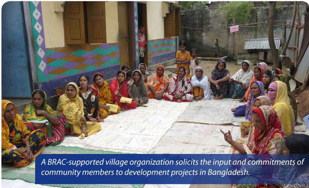
A BRAC-supported village organization solicits the input and commitments of community members to development projects in Bangladesh.

3. Partnership: to join top-down efforts with the views of beneficiaries of programs so that there are complementarities between different interests, particularly by developing horizontal relationships between community organizations to bring the voice of local people to the development table.