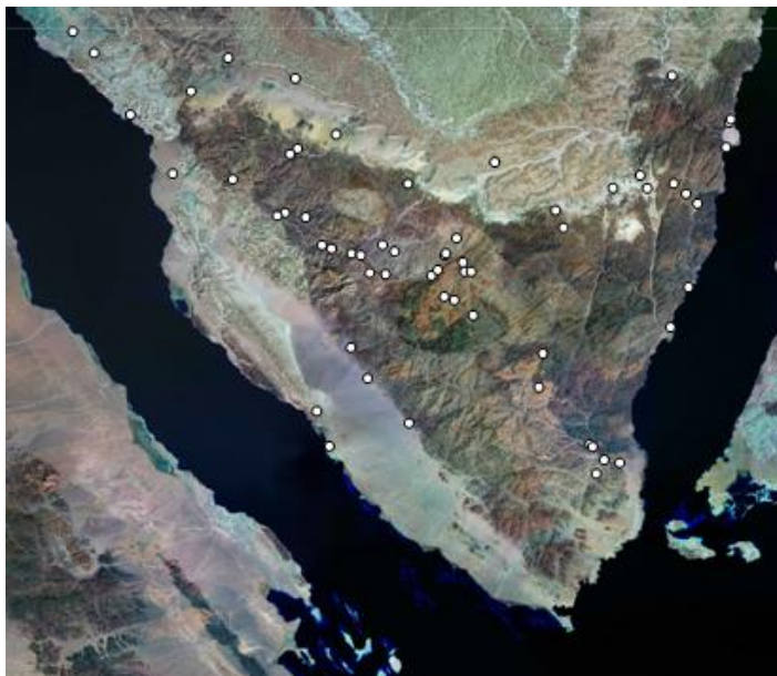
Fig 1: South Sinai showing locations of 62 community meetings. Areas not covered are either uninhabited or compromised by illegal activity.

We were completely taken aback by the strength of response to our meetings: in a population estimated at around 40,000, spread across small towns, villages and remote desert hamlets, average attendance at the 62 meetings we eventually held was 44 . No fewer than 2749 people - approaching 7% of the whole estimated population - having been offered an arena where they could speak out safely, came together to discuss their ideas, rights and priorities.