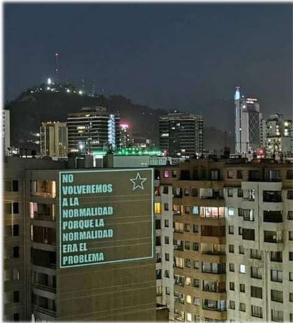
We won't go back to normal because normal was the problem

The "old normality" in Latin America, although today it produces nostalgia in many, was not a rose garden, as described in the introduction of this document. Moreover, this "old normality" could be attributed to the emergence of the COVID-19 pandemic as a result of environmental deterioration, uncontrolled globalization and consumption, global warming, and genetic mutations resulting from interventions in nature and its life cycles.